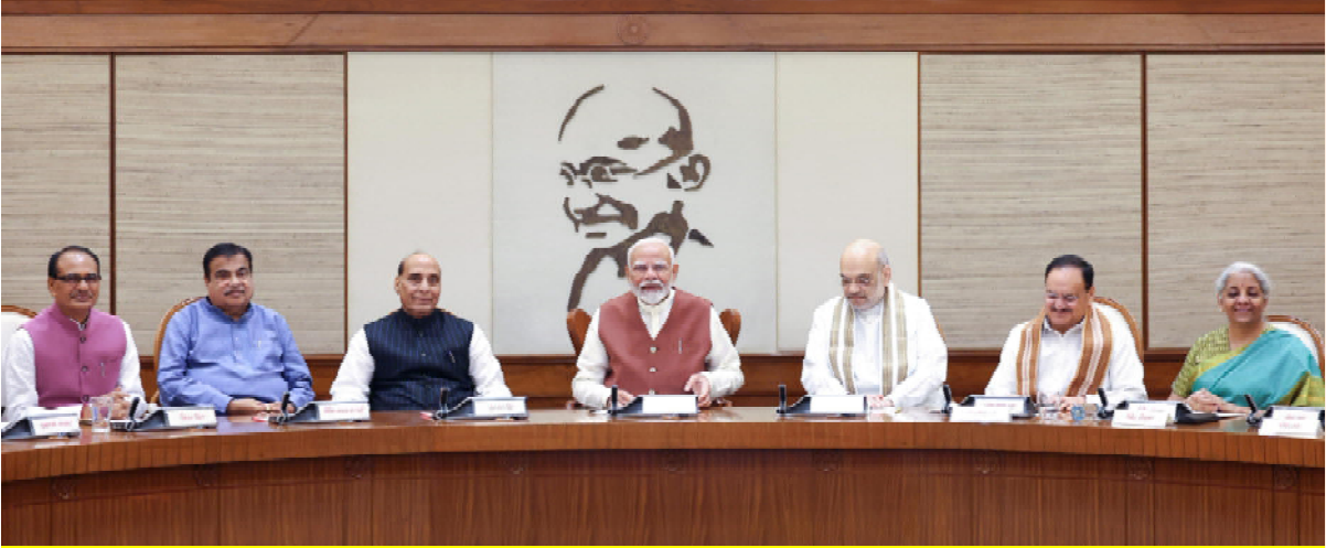
PM chairs the first Union Cabinet meeting, in New Delhi on June 10, 2024.

New Delhi, June 11 The Government will provide assistance to three crore additional rural and urban households for the construction of houses under the Pradhan Mantri Awas Yojana. A decision in this regard was taken in the first cabinet meeting of the newly-formed NDA Government in New Delhi yesterday. The Central Government has been implementing the Pradhan Mantri Awas Yojana since 2015 to provide assistance to eligible rural and urban households for the construction of houses with basic amenities. Under the scheme, a total of 4 crore 21 lakh houses have been completed for eligible poor families in the last ten years. (Source: newsonair.gov.in)